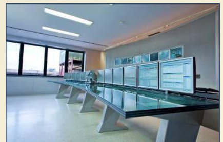
Electrics & Automation Systems

Over 60 Years in Designing & Building Coke Oven Plants