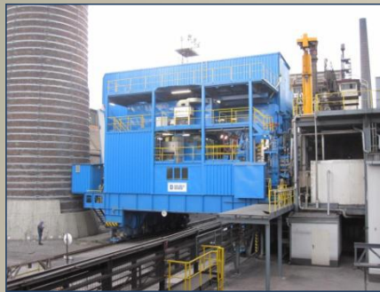
Coke Battery Cars & Machines