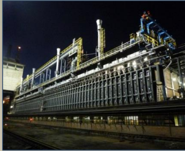
Coke Battery Construction