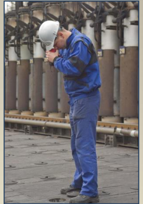
Battery optimisation & regulation