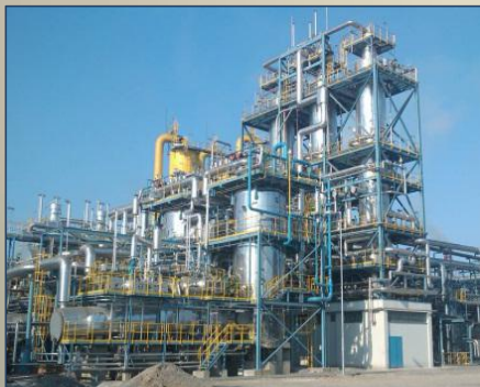
Chemical By Products Plant